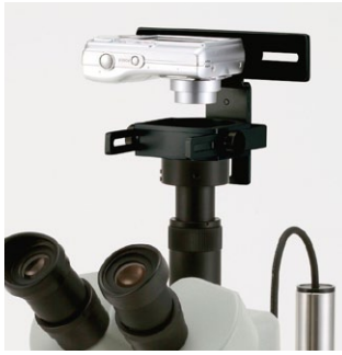
Z1018 Adapter for compact cameras