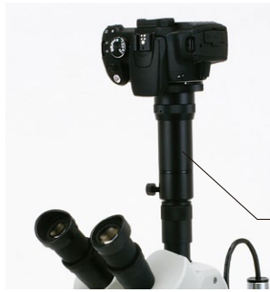
DG Adapter for SLR cameras (requires camera- specific T-mount adapter)